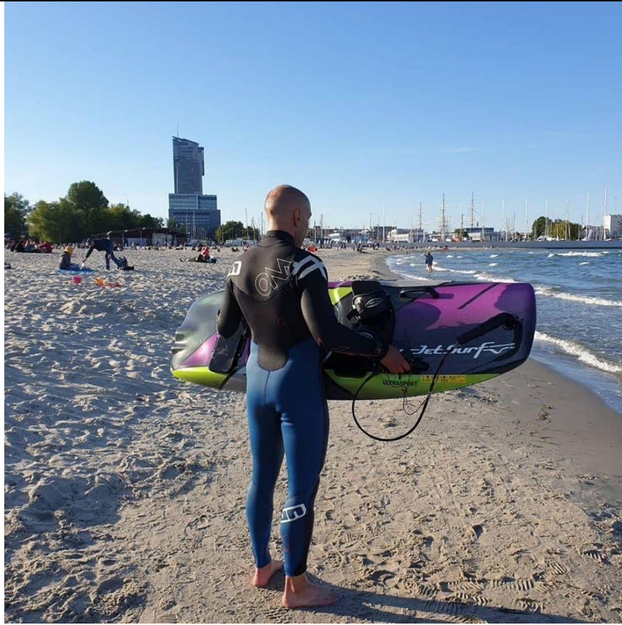
On the way